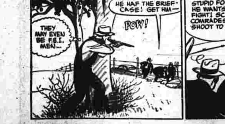
"You think so, eh?"

Answer to Previous Puzzle Dames' Names HORIZONTAL 1 Heart, 2 Marie, 3 princess, 4 She's sweet, 5 Prayer ending, 6 Dividing bird, 7 Pen point, 8 Meat, 9 benevolent, 10 thoroughfare, 11 Comforts, 12 Insurance, 13 French port, 14 Russian ruler, 15 Fairy queen, 16 Enlace, 17 Flaten again, 18 Depend, 19 Girl's name, 20 Compass point, 21 Daze, 22 Skin eruption, 23 41 French sea, 24 Fill with horror, 25 Lying in a den, 26 Card showing place at table, 27 Heaving organ, 28 Wilbered, 29 An Oklahoma city was named for her, 30 Falsehood, 31 Conscience, 32 Swift, 33 Fortune, 34 Vertice, 35 Fastens, 36 Revises