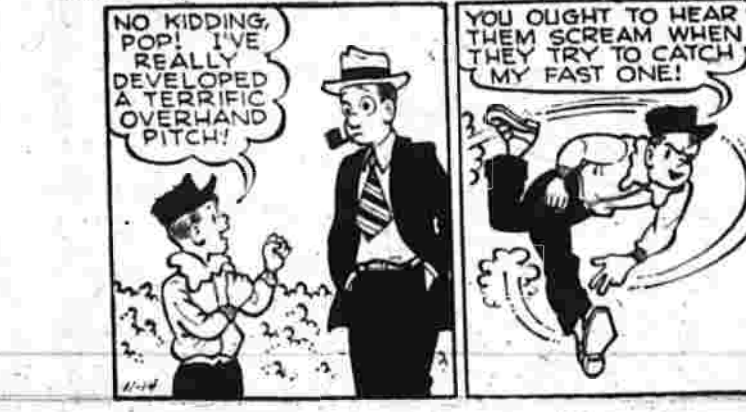
"You think so, eh?"

Answer to Previous Puzzle Dames' Names HORIZONTAL 1 Heart, 2 Marie, 3 princess, 4 She's sweet, 5 Prayer ending, 6 Dividing bird, 7 Pen point, 8 Meat, 9 benevolent, 10 thoroughfare, 11 Comforts, 12 Insurance, 13 French port, 14 Russian ruler, 15 Fairy queen, 16 Enlace, 17 Flaten again, 18 Depend, 19 Girl's name, 20 Compass point, 21 Daze, 22 Skin eruption, 23 41 French sea, 24 Fill with horror, 25 Lying in a den, 26 Card showing place at table, 27 Heaving organ, 28 Wilbered, 29 An Oklahoma city was named for her, 30 Falsehood, 31 Conscience, 32 Swift, 33 Fortune, 34 Vertice, 35 Fastens, 36 Revises