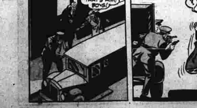
"You think so, eh?"

Answer to Previous Puzzle Dames' Names HORIZONTAL 1 Heart, 2 Marie, 3 princess, 4 She's sweet, 5 Prayer ending, 6 Dividing bird, 7 Pen point, 8 Meat, 9 benevolent, 10 thoroughfare, 11 Comforts, 12 Insurance, 13 French port, 14 Russian ruler, 15 Fairy queen, 16 Enlace, 17 Flaten again, 18 Depend, 19 Girl's name, 20 Compass point, 21 Daze, 22 Skin eruption, 23 41 French sea, 24 Fill with horror, 25 Lying in a den, 26 Card showing place at table, 27 Heaving organ, 28 Wilbered, 29 An Oklahoma city was named for her, 30 Falsehood, 31 Conscience, 32 Swift, 33 Fortune, 34 Vertice, 35 Fastens, 36 Revises