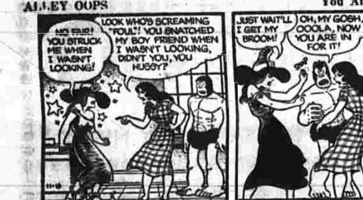
"You think so, eh?"

Answer to Previous Puzzle Dames' Names HORIZONTAL 1 Heart, 2 Marie, 3 princess, 4 She's sweet, 5 Prayer ending, 6 Dividing bird, 7 Pen point, 8 Meat, 9 benevolent, 10 thoroughfare, 11 Comforts, 12 Insurance, 13 French port, 14 Russian ruler, 15 Fairy queen, 16 Enlace, 17 Flaten again, 18 Depend, 19 Girl's name, 20 Compass point, 21 Daze, 22 Skin eruption, 23 41 French sea, 24 Fill with horror, 25 Lying in a den, 26 Card showing place at table, 27 Heaving organ, 28 Wilbered, 29 An Oklahoma city was named for her, 30 Falsehood, 31 Conscience, 32 Swift, 33 Fortune, 34 Vertice, 35 Fastens, 36 Revises