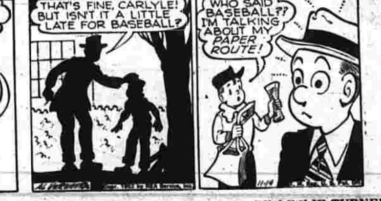
"Well, well, see about that right now!"