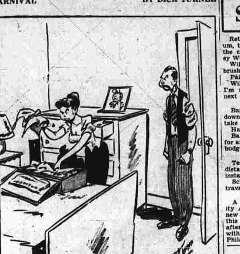
"You'd see a big improvement in my driving if you'd take down that old fence altogether!"