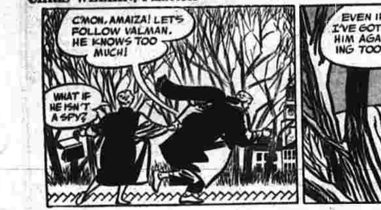
"You think so, eh?"

Answer to Previous Puzzle Dames' Names HORIZONTAL 1 Heart, 2 Marie, 3 princess, 4 She's sweet, 5 Prayer ending, 6 Dividing bird, 7 Pen point, 8 Meat, 9 benevolent, 10 thoroughfare, 11 Comforts, 12 Insurance, 13 French port, 14 Russian ruler, 15 Fairy queen, 16 Enlace, 17 Flaten again, 18 Depend, 19 Girl's name, 20 Compass point, 21 Daze, 22 Skin eruption, 23 41 French sea, 24 Fill with horror, 25 Lying in a den, 26 Card showing place at table, 27 Heaving organ, 28 Wilbered, 29 An Oklahoma city was named for her, 30 Falsehood, 31 Conscience, 32 Swift, 33 Fortune, 34 Vertice, 35 Fastens, 36 Revises