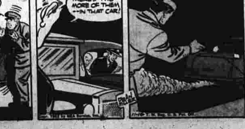
"Well, well, see about that right now!"