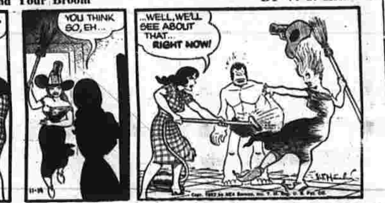
"Well, well, see about that right now!"