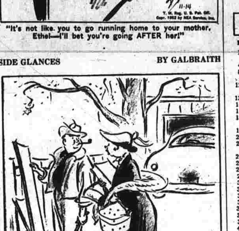
"You'd see a big improvement in my driving if you'd take down that old fence altogether!"

Answer to Previous Puzzle Dames' Names HORIZONTAL 1 Heart, 2 Marie, 3 princess, 4 She's sweet, 5 Prayer ending, 6 Dividing bird, 7 Pen point, 8 Meat, 9 benevolent, 10 thoroughfare, 11 Comforts, 12 Insurance, 13 French port, 14 Russian ruler, 15 Fairy queen, 16 Enlace, 17 Flaten again, 18 Depend, 19 Girl's name, 20 Compass point, 21 Daze, 22 Skin eruption, 23 41 French sea, 24 Fill with horror, 25 Lying in a den, 26 Card showing place at table, 27 Heaving organ, 28 Wilbered, 29 An Oklahoma city was named for her, 30 Falsehood, 31 Conscience, 32 Swift, 33 Fortune, 34 Vertice, 35 Fastens, 36 Revises