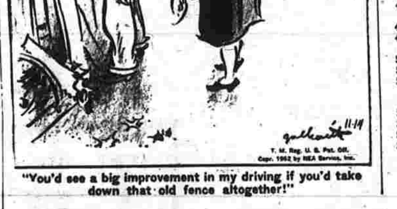
"You'd see a big improvement in my driving if you'd take down that old fence altogether!"

Answer to Previous Puzzle Dames' Names HORIZONTAL 1 Heart, 2 Marie, 3 princess, 4 She's sweet, 5 Prayer ending, 6 Dividing bird, 7 Pen point, 8 Meat, 9 benevolent, 10 thoroughfare, 11 Comforts, 12 Insurance, 13 French port, 14 Russian ruler, 15 Fairy queen, 16 Enlace, 17 Flaten again, 18 Depend, 19 Girl's name, 20 Compass point, 21 Daze, 22 Skin eruption, 23 41 French sea, 24 Fill with horror, 25 Lying in a den, 26 Card showing place at table, 27 Heaving organ, 28 Wilbered, 29 An Oklahoma city was named for her, 30 Falsehood, 31 Conscience, 32 Swift, 33 Fortune, 34 Vertice, 35 Fastens, 36 Revises